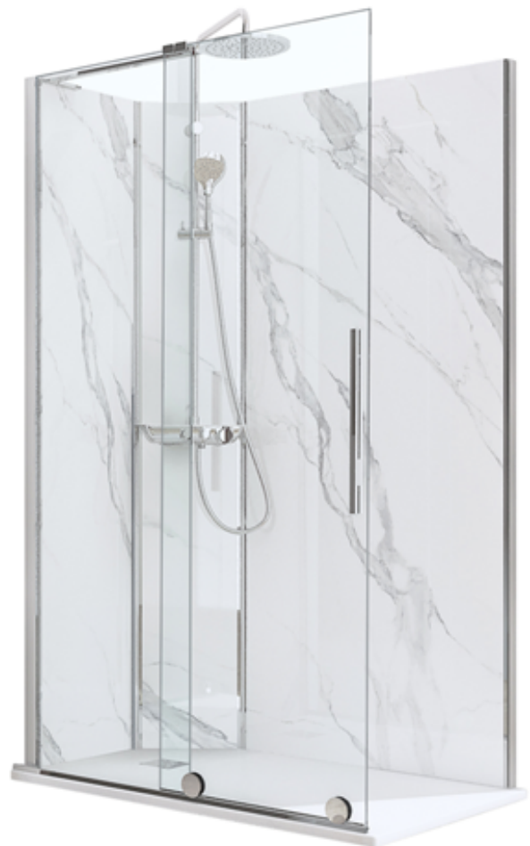
CONCEPT SKY MARBLE

A quick answer to demands at all times, knowledge sharing, adapting oneself to all situations, repairing all our products thanks to a long spare parts storage, providing the most sustainable responses.